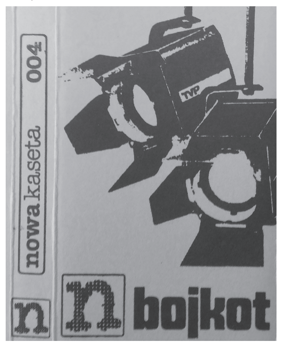
Figure 1. Cover art for Boycott (1983).